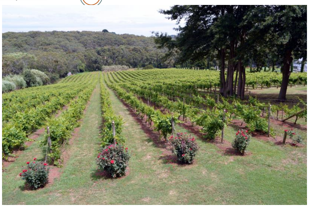
View from Abelli Vineyard deck. See report on page 4.